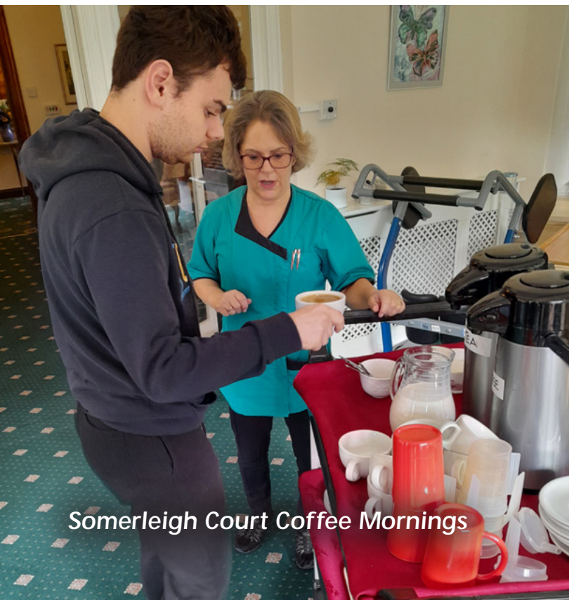
Somerleigh Court Coffee Mornings

These connections help to embed our young people in their local communities, use their skills and give back. Putting them environments where they can thrive, encouraging teamwork, communication, planning and execution, while also boosting confidence. They give students the opportunity to take pride in something they've built, or funds they have raised, and also help to show everyone in the community our students' abilities, enthusiasm, drive, and creativity.