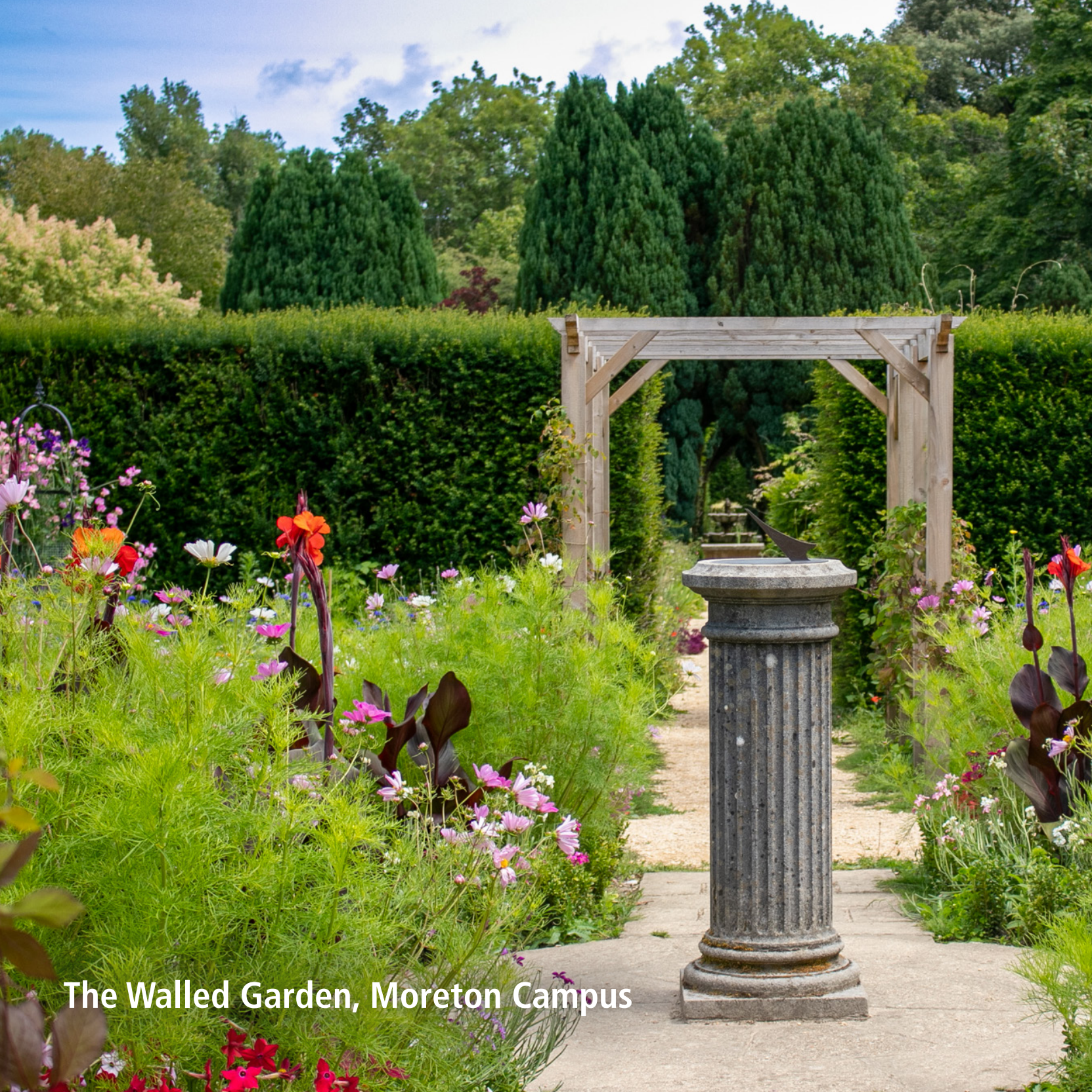
The Walled Garden, Moreton Campus