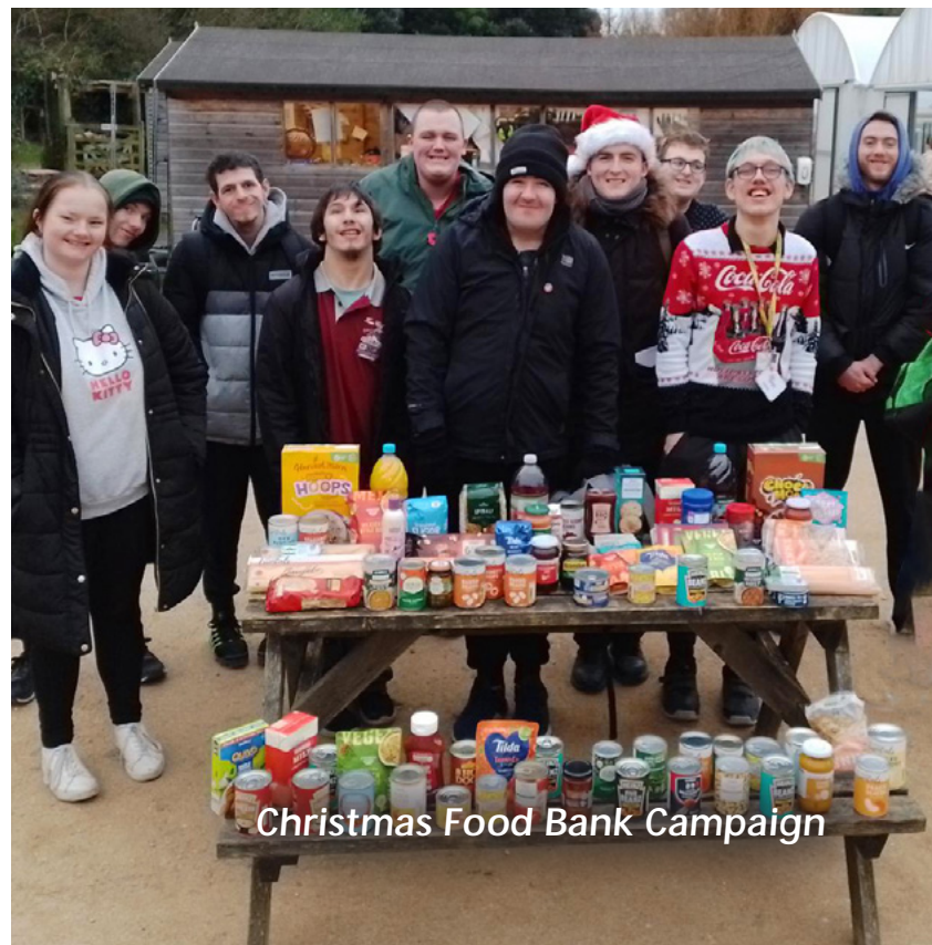
Christmas Food Bank Campaign